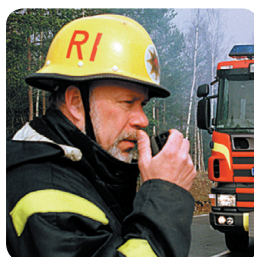
RESCUE & SECURITY