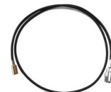
External Antenna Adapter